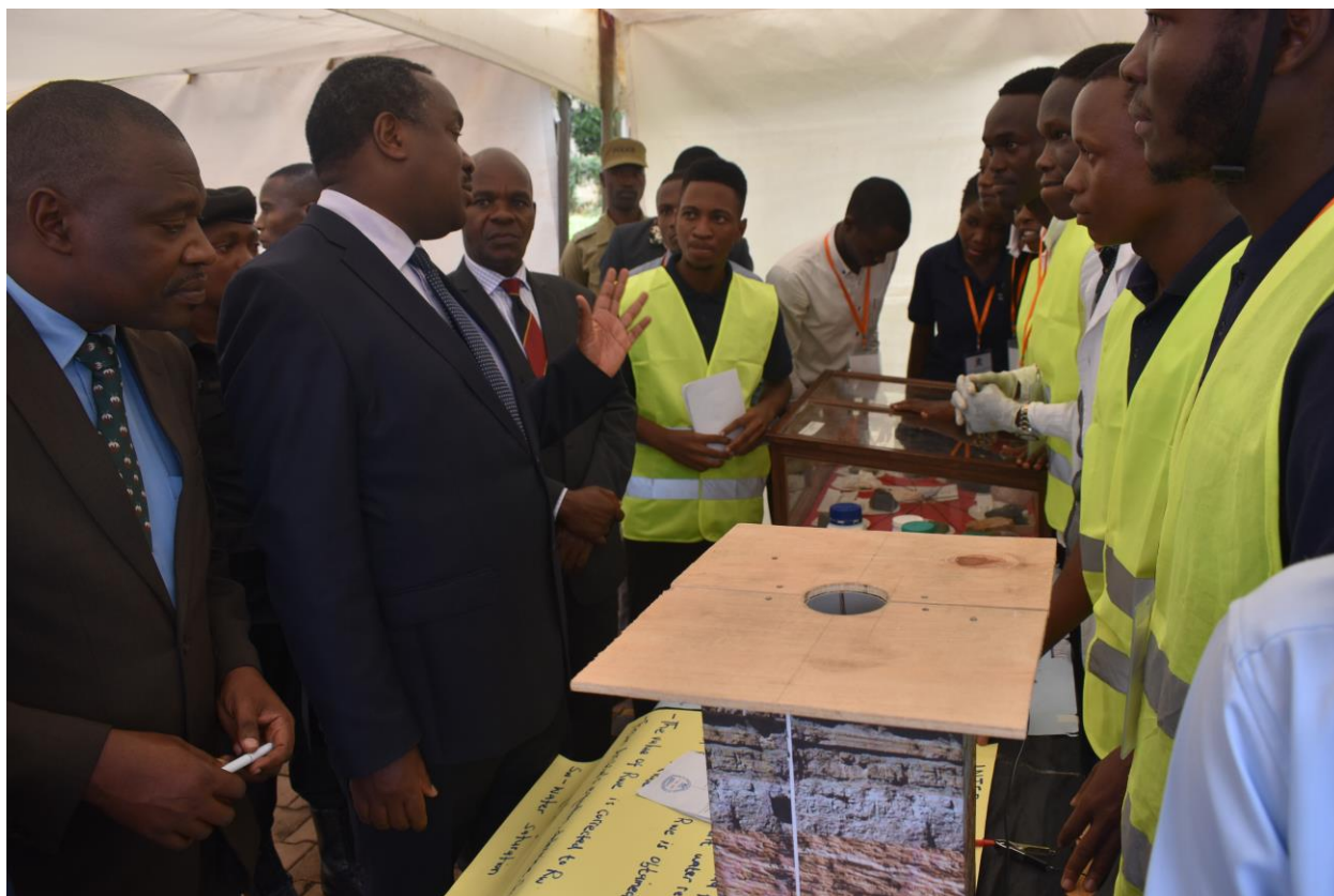
Hon. Elioda Tumwesigye – Minister for Science, Technology and Innovations meeting students at the World Science Day Celebrations exhibition.