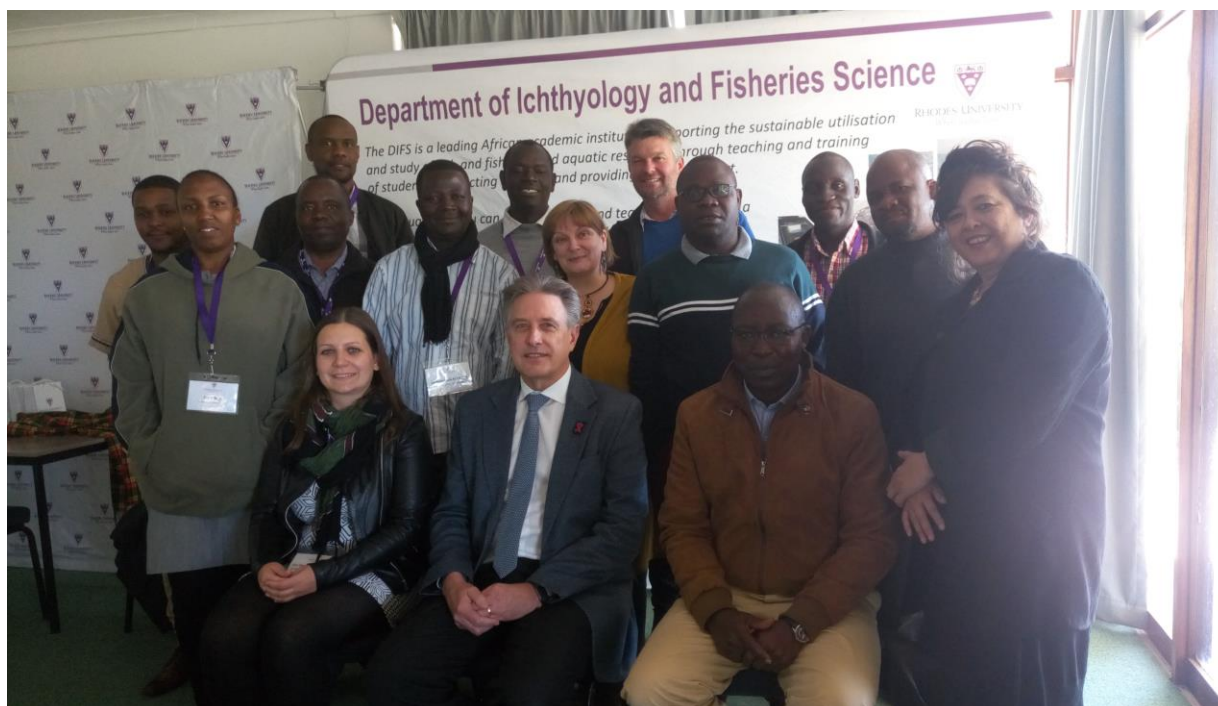
CoTRA Team attending meeting at University of Rhodes, South Africa