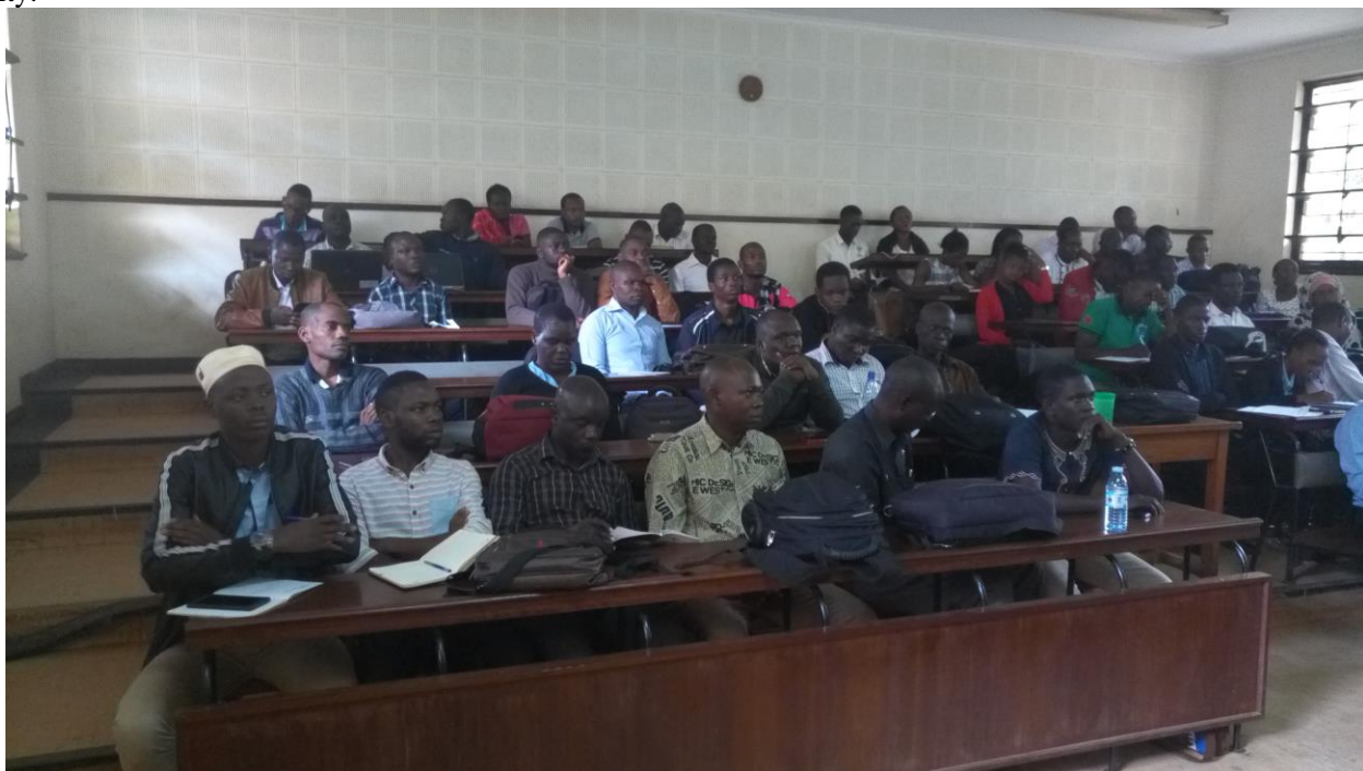
Participants at the Microbio Seminar