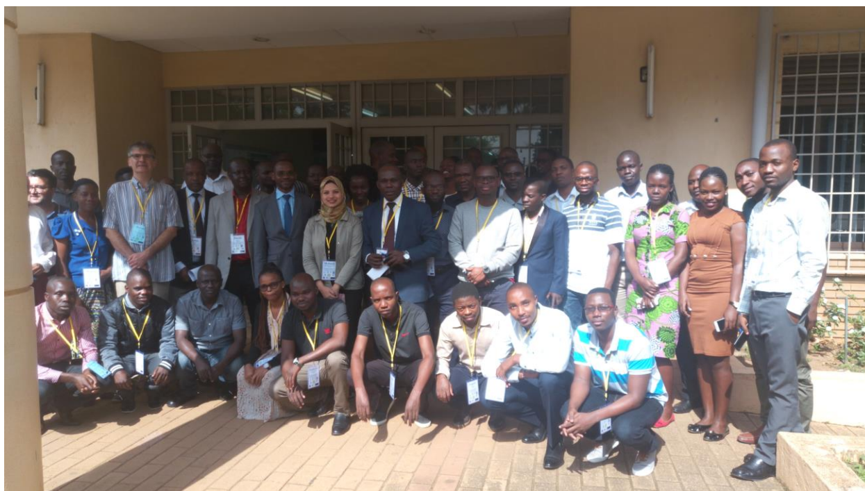
Participants at the 19 th EAUMP Mathematics Summer School

The funders of the summer school include Makerere University; Uppsala University, Sweden; International Science Programme (ISP); SIDA; London Mathematical Society and Centre International de Mathématiques Pures et Appliquées (CIMPA).