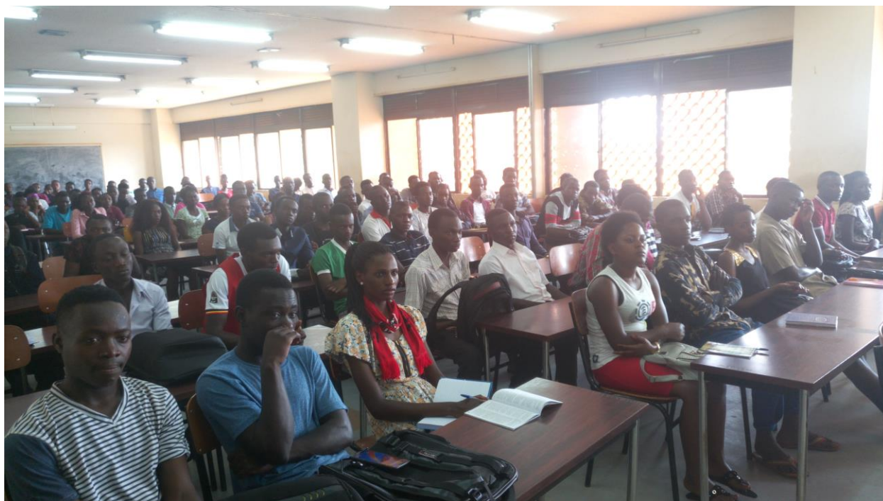
Fresher students attending the orientation meeting

The College of Natural Sciences (CoNAS) leadership met the undergraduate fresher students on the 7 th August 2019. Every year fresher students are oriented at the College following an orientation at the University level. The students are informed of the university processes; they are also cautioned about what affects studies. Arising from discussions at the College Academic Boarding meeting it was agreed that the orientation for CoNAS graduate students be held at the College level which had not been done in previous academic years. The Graduate students meeting was held on the 5 th September 2019.