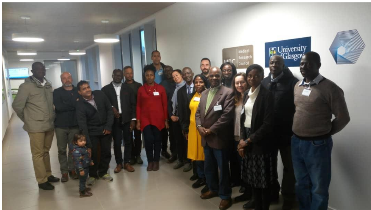
Participants at the ASF-RESIST Glasgow Meeting

The ASF-RESIST partners converged at the Centre for Virus Research (CVR), University of Glasgow, UK for the action's second annual review and planning. The meeting held from the 2 nd – 3 rd December 2019 was attended by members from Makerere University, National Veterinary Institute of Nigeria, National Veterinary Institute - Sweden, BecA-ILRI Hub – Kenya and CVR. The ASF-RESIST action granted $1.2m by the African Union and European Union Commission was launched in 2018 and will end in 2021.